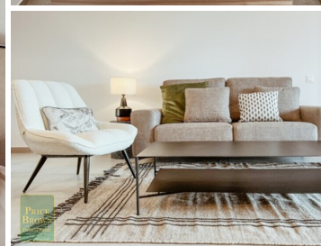
Desert Springs Sierra 347 - An apartment in the Cuevas del Almanzora area. (Newly Built)

Las Sierras III is a private residential development with a selection of NEW two and three-bedroom 'Key-Ready' Apartments set around a private swimming pool, complete with outdoor lounge space, within beautiful landscaped gardens, occupying an envious position on Desert Springs Resort.