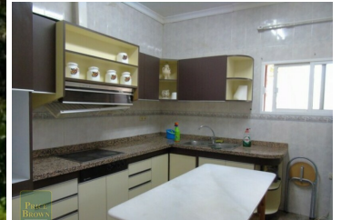
Finca de Clemente Garcia - A country house in the Olula del Rio area. (Resale)

REDUCED!! Large country property comprising a 4 bedroom main house, a separate guest annexe, two industrial buildings and a large water deposit, all set in land of around 38.000m 2 . This versatile property for sale in Almeria Province is situated between the valley towns of Olula del Rio and Purchena, both of which offer all amenities.